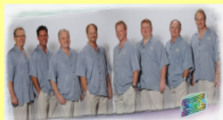
Band of Oz Saturday Noon

Special rates at area motels (see website)