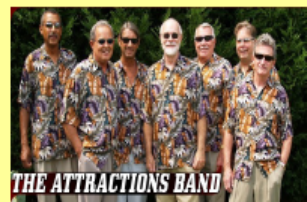
The Attractions Saturday Afternoon

Sunday morning — shrimp & grits with all gospel music