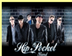
Hip Pocket Friday Night