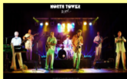
North Tower Saturday Night

Directions: 3 1/2 mi. south of Roxboro off NC Hwy 49 on Blalock Dairy Road. 965 Blalock Dairy Rd Roxboro NC 27574